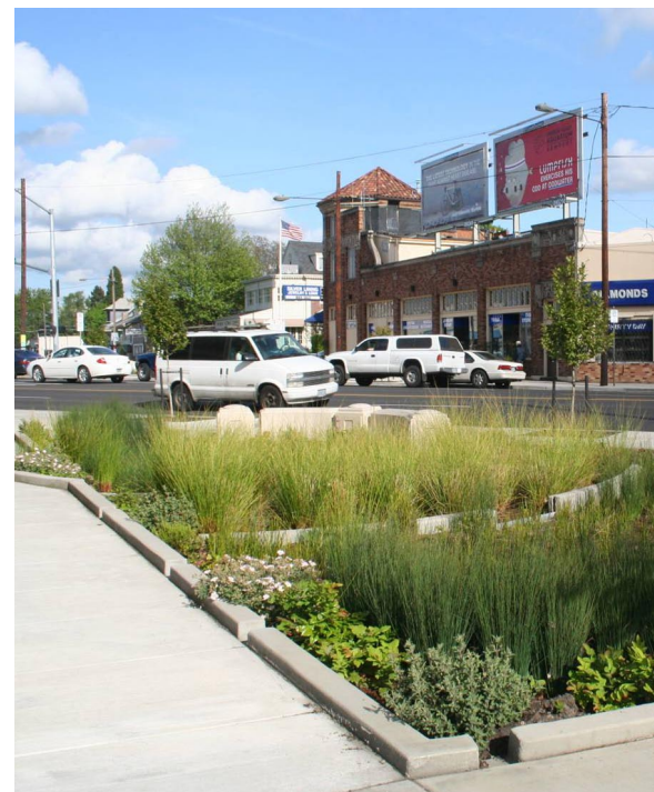
Figure 5-3: The rain garden as it exists today.