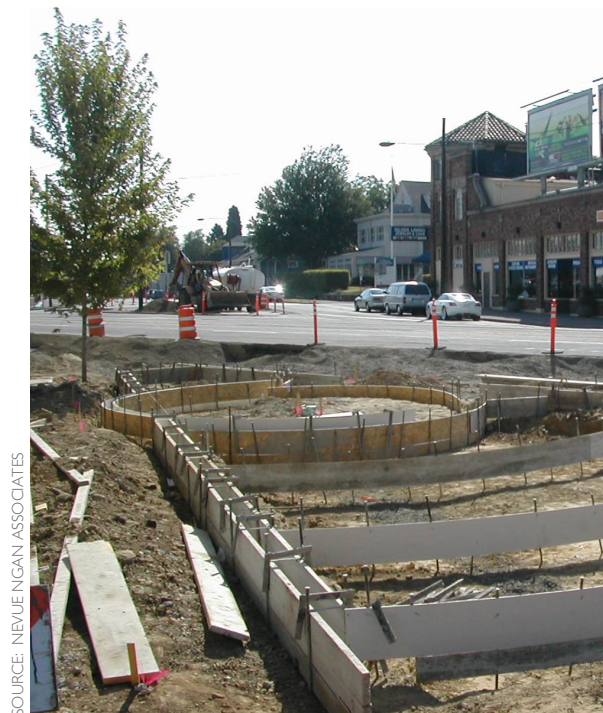
Figure 5-2: The rain garden construction process along Sandy Boulevard.

The previous chapter envisioned opportunities that exist for green streets and parking lots in San Mateo County. This chapter helps to support this vision by providing a more detailed discussion on key design and construction considerations in building green street and parking lot projects. These details support the information found in the C.3 Technical Guidance, but they are specifically tailored to green street and parking lot applications. Some of the information presented in this chapter is in response to the ongoing concerns and/or questions that many designers, policy makers, and contractors have about creating successful projects. This chapter contains two main sections: “Design Details” and “Construction Details.” The final subsection of the chapter provides a chart illustrating the key components of green street and parking lot construction administration.